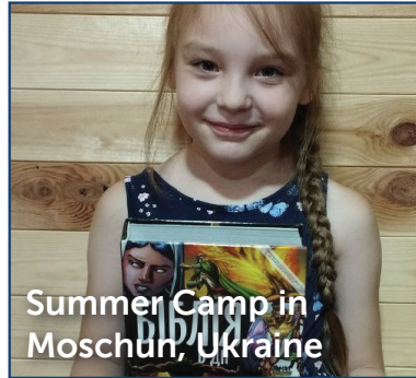
Summer Camp in Moschun, Ukraine