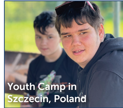
Youth Camp in Szczecin, Poland