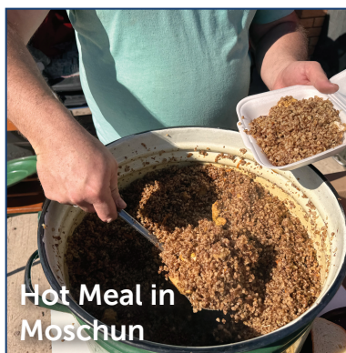
Hot Meal in Moschun