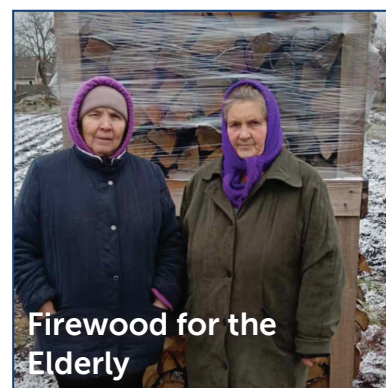
Firewood for the Elderly