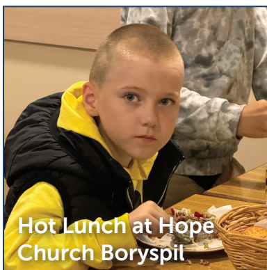
Hot Lunch at Hope Church Boryspil