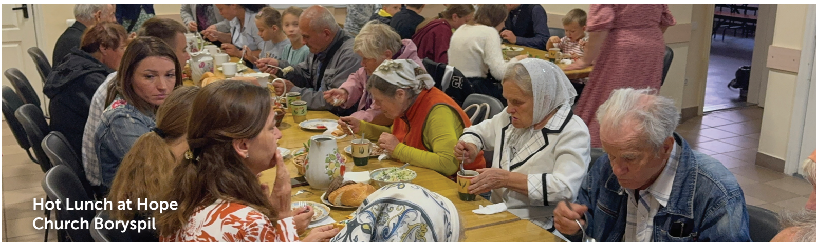
Hot Lunch at Hope Church Boryspil