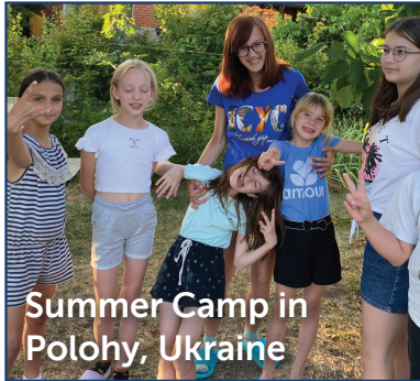
Summer Camp in Polohy, Ukraine