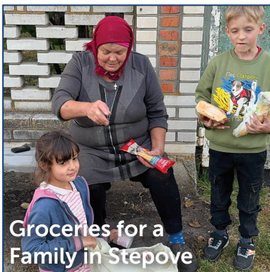
Groceries for a Family in Stepove

Thanks to your generosity in 2025, Mission Partners increased the number of meals provided from 7,000 to 8,000. Through food bags, hot meal programs, and pastoral home visits—where families received groceries, firewood, prayer, and counselling—your support helped people endure difficult conditions and reminded them they are not forgotten.