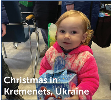
Christmas in Kremenets, Ukraine

These outreach programs are combined with ongoing Christian mentorship and discipleship for families. Throughout 2025 many relationships were built as local ministry partners served vulnerable families with our uniquely combined approach of poverty alleviation and Biblical discipleship.